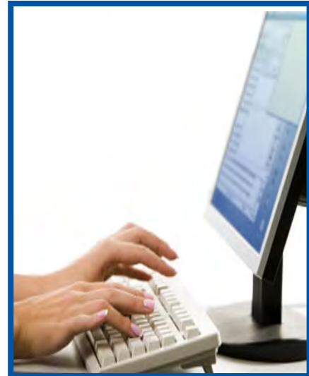
Freight Forwarder/ 3PL Shipper computer system